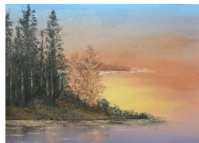
Table easels and photo references provided. Classes are held throughout the year by appointment.

Tea and coffee are provided and available throughout the duration of the class.